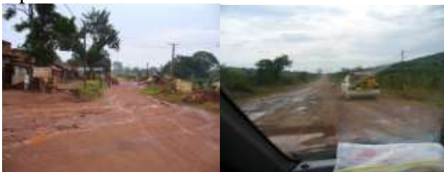
Roads in Uganda 2008

Over the years the 'need' for transport has increased considerably and vehicles have improved in build quality, comfort, and become more 'user friendly' for the average initial buyer in highly developed countries. This results in vehicles that are adequate for use on paved, and in a restricted way, on unpaved roads. However this means that modern vehicles tend to be too complicated for "#8 wire" style repairs, and not rugged or compliant enough to cope with sustained use in harsh conditions.