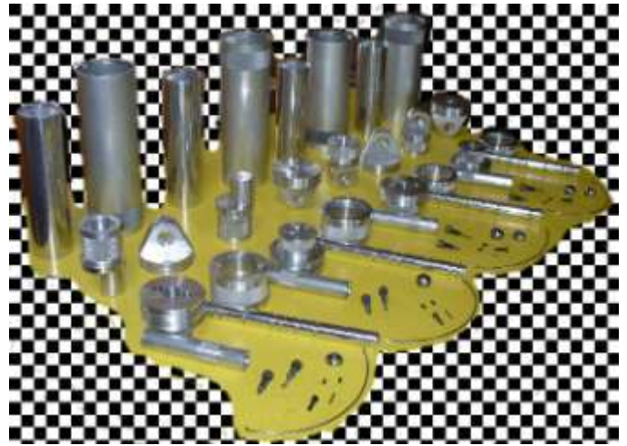
Mk2 components ready for anodizing.

After testing Mk1 to destruction in 'Taupo 1000' 2009 I set about improving and refining the design with what I had learnt. I had no data on the performance or footage of Mk1, just the remains and the memory of what it had felt like in relation to what the terrain had looked like. A rather imprecise science to say the least! As a result Mk2 was basically an improvement on construction methods to give better longevity, so as to test and record performance.