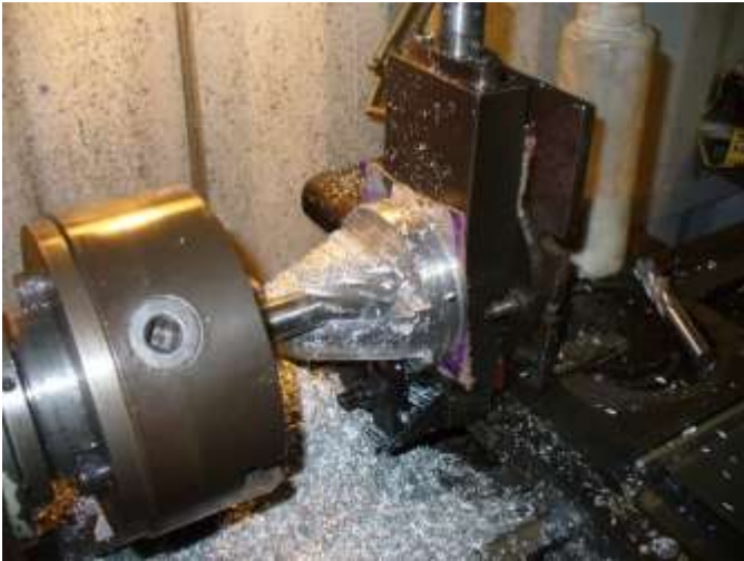
Milling in the Lathe.

car launched in a very civilized manner, without the familiar slam of the suspension bottoming out.