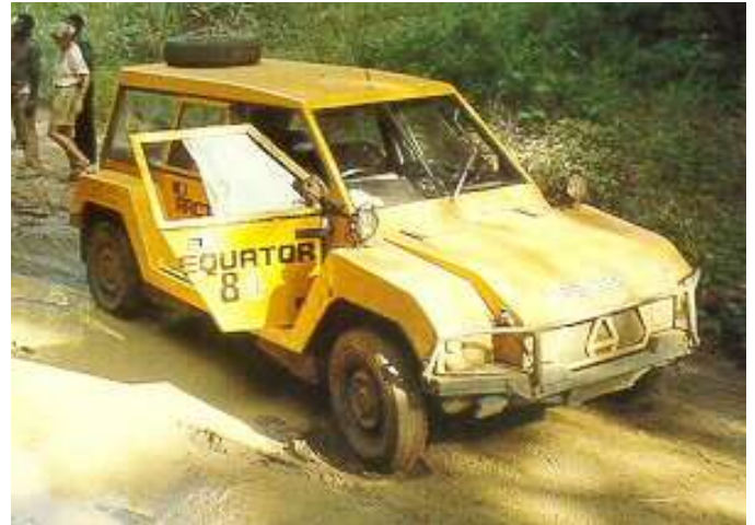
Africar prototype station wagon on the way down Africa in 1984