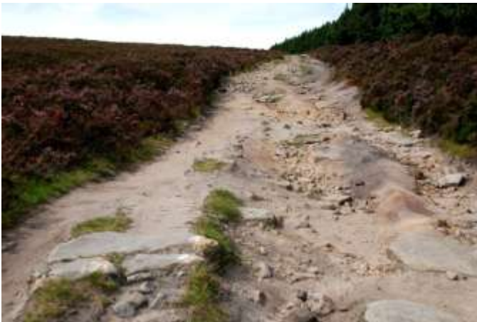
A Normal Road?

What is a normal road? Our experience may be limiting our view. While the greatest percentage of the 70,000,000 vehicles produced annually are certainly used on paved roads, roughly half of the world's road remain unpaved (over 13,000,000kms of it!). For many, this is their 'normal' road they have to use every day.