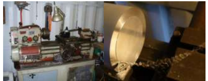
My lovely 1950s Kerry AG, has done close to a thousand hours prototyping Levitation.

Finally I had a design that in theory I could build, so it was time to start acquiring the skills I would need to build it and start saving money to fund the project.