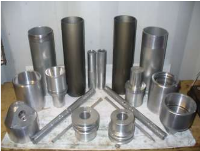
Mk1 components ready for assembly.

Returning from Uganda with a concept drawn up of a suspension system that should self adjust its spring rate to maintain a set ride height, should be able to have several height settings controlled from the cab, and should totally eliminate all shock loading from bottoming out or over extending was motivating.