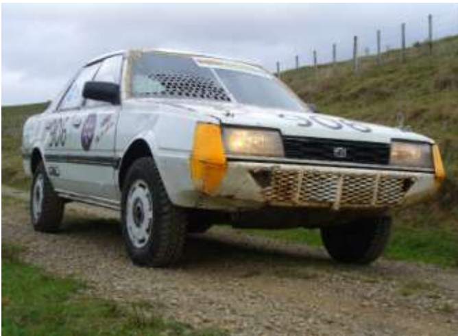
HEIDI the Paddock Car ready to race, fitted with 'Levitation'.

I then built a pair for the rear suspension and finished installing them just in time to set off to Taupo again.