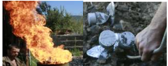
While the outcome of home casting attempts looked reasonable, I could not get consistent temper, so resorted to machining out of extruded solid 6061 bar.

I bought myself a 1950 Kerry AG lathe off Trademe, and set about learning to machine components. I melted down old aluminium castings in a fire, burnt off eyebrows, cast parts in bowls of sand, and generally behaved like Burt Munro!