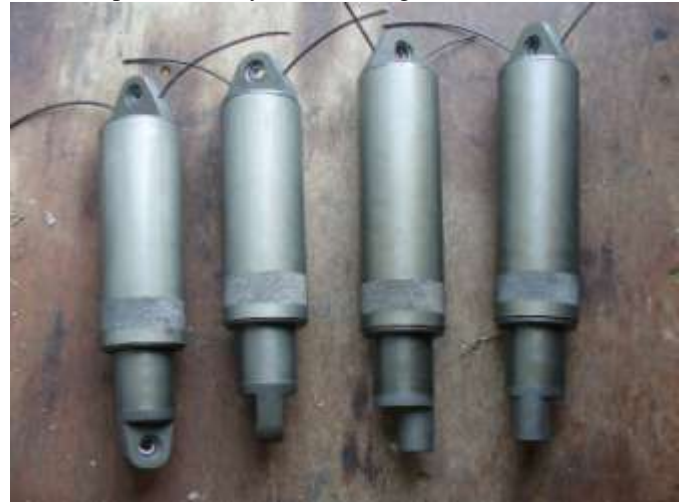
Mk 2 units

The first test drive of Mk2 was appalling! Height control was working fine, but it was ultra stiff and had virtually no damping. An hour later the four units were dismantled and I was trying to work out what I had done wrong. I had at least made them in such a way that they were easy to work on!