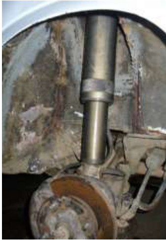
Mk 2 installed.

For two months and hundreds of kms, I tested, adjusted, jumped, filmed, and raced Mk2 prototypes. I found a few things that I would try different for Mk3, but on the whole they performed beyond my dreams.