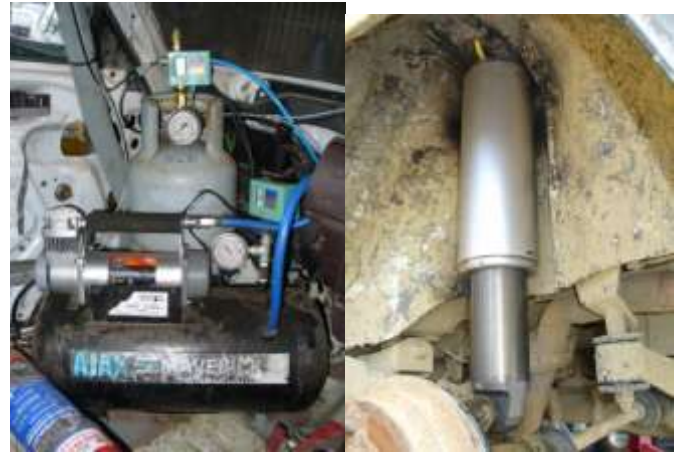
Air system on a budget. 12v compressor takes it to 40psi in the black tank to feed A/C unit that takes it to 150psi. Rear Mk1 installed.

Late one night I finally had the units fitted and the compressed air system installed. started it up and watched to see if the suspension would indeed maintain the set ride height. She gradually lifted off her bump stops and sure enough stabilized at the desired ride height. I sat on the bonnet and sure enough the nose dipped for a few moments before returning to ride height.